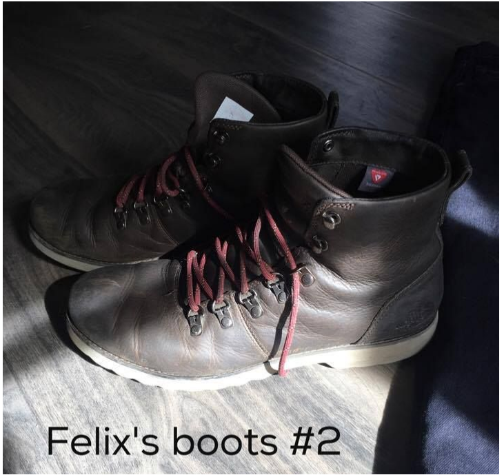
Felix's boots #2