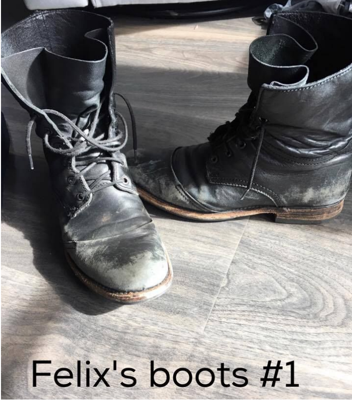
Felix's boots #1