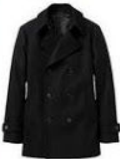
Pea Coat (Dark Blue, Charcoal, Med. Grey) [Various]