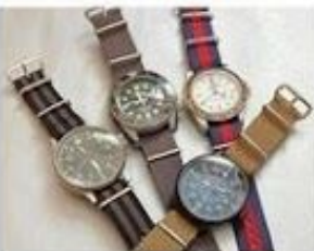
NATO Straps (All Colors) [Crown & Buckle]