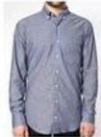
Chambray (Light Blue, Grey)