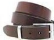
Belts (Shades of Brown) [GAP, Orion, Macy's, etc.]