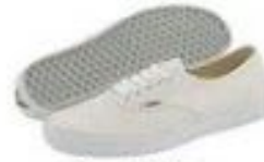
Canvas Sneakers (White, Grey, Black, Navy) [Zappos, etc.]