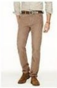
Corduroy Pants (Khaki, Brown, Olive, Grey) [Varies by Season]