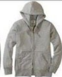
Hoodie (Light Blue, Olive, Grey, Lavender) [American Apparel, JCP, UNIQLO]