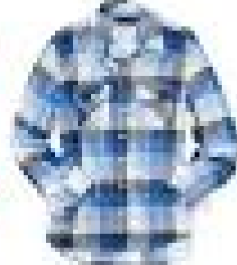
1 white shirt (for formal wear) & 5 shirts (variety)