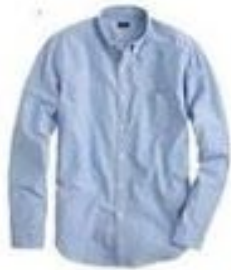
OCBD (Light Blue, White, Lavender) [JCP, GAP, Old Navy, UNIQLO]