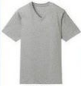
V-Neck Tee (Light Blue, Olive, White, Lavender) [JCP, GAP, Target, UNIQLO]