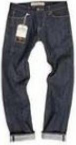
Raw Denim (Various) [Nudies, H&F, etc.]