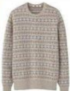
Fair Isle Sweater (Earth Tones)