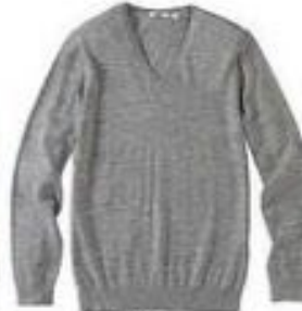
V-Neck Sweater (Navy, Charcoal, Heather) [UNIQLO, Target, GAP]