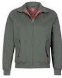
Harrington Jacket (Tan, Grey, Navy, Olive) [Merc, Ben Sherman, Various Others]