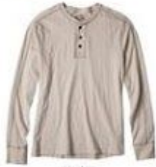
Henley (Various) [JCP, Target, GAP]