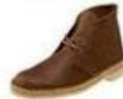
Clark's Desert Boots (COB's) (Brown) [Amazon, Zappos, etc.]