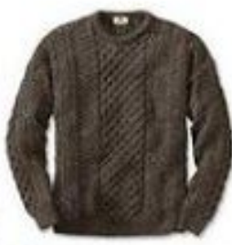
Cable-Knit / Fisherman Sweater (Cream, Grey, Navy)