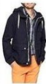
Light Jacket / Parka (Earth Tones, Bold, Bright) [Various]