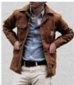
Chore Coat (Khaki, Brown, Navy, Grey) [Pointer]