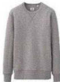
Crew Neck Sweater (Navy, Charcoal, Heather) [UNIQLO, Target, GAP]