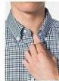
Gingham Button-Down (Various)