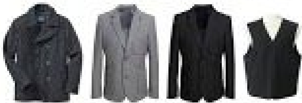
t-shirt, hoodie, sweater, windbreaker jacket, winter coat, gray blazer, black blazer with vest (for formal wear)