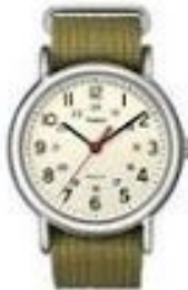
Timex Weekender (Strap: Olive, Navy, Burgundy) [Amazon, Macy's]