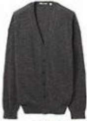
Cardigan (Charcoal, Heather, Olive, Burgundy) [Target, GAP, Old Navy, UMIQLO]