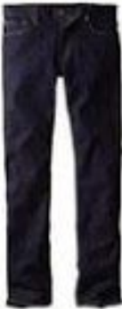
Dark Non-Distressed Jeans (Dark Blue, Midnight, etc.) [Levi's 511, 514; UNIQLO]