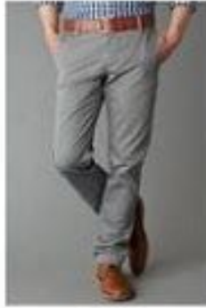
Chinos (Khaki, Olive, Brown, Charcoal) [Dockers Alpha]